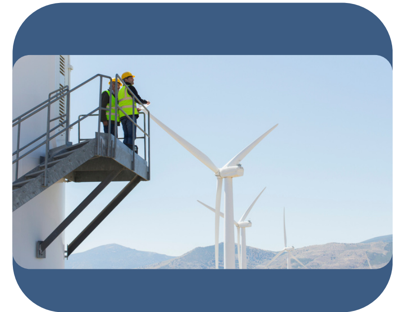
Recruiting Process Outsourcing (RPO)